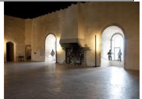
Great hall – Castle of Thun