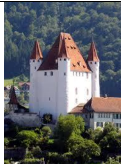
Castle of Thun